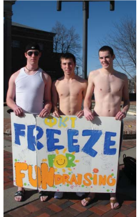
Members of Phi Tau spend time on the mall in their swimsuits in January