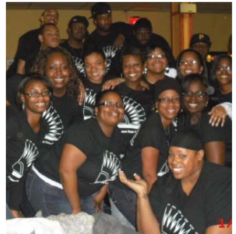
NPHC Greeks during their bowling event at Leisure World during the NPHC Unity Weekend

The store keeps approximately five books of fabric on hand that you can chose from, but bringing your own fabric in is not allowed. Processing time is generally two weeks.